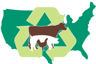
Livestock and Poultry Environmental Stewardship (LPES) Curriculum